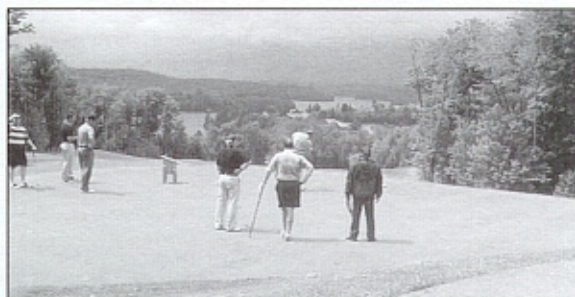
Tee-off at the first hole attracts an interested group of on-lookers.